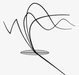
Croatian Microscopy Society